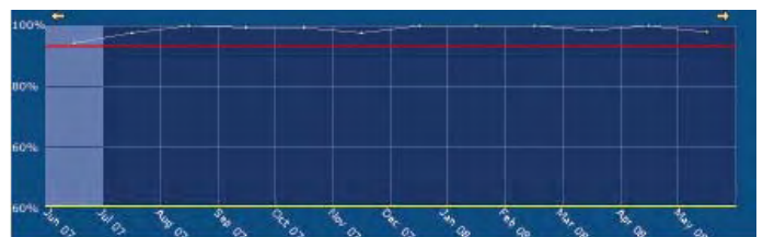
Reliability trend graph with alarm level.