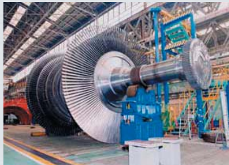
Right: production of an ACR 700 turbine, based on Hitachi design

ROVSING Dynamics' ongoing business development of the Japanese market has further resulted in continued communication with another potential future partner.