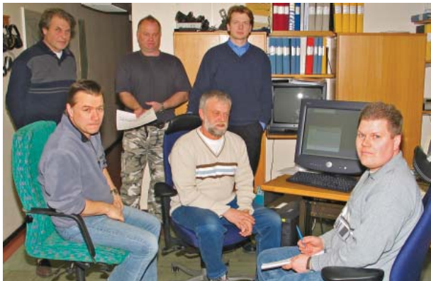
Above: Participants at a training session at Rya Heat Pump Plant in Sweden, March 2004

The scope of the training comprises an introductory background in predictive maintenance and the role of OPENpredictor™ in this context, as well as an in-depth insight into the system applications and practical training for the operating and maintenance staff. Finally, offering specialist training in diagnostic practice where staff with appropriate background and interests are present. The training focuses on benefits for the organisation.